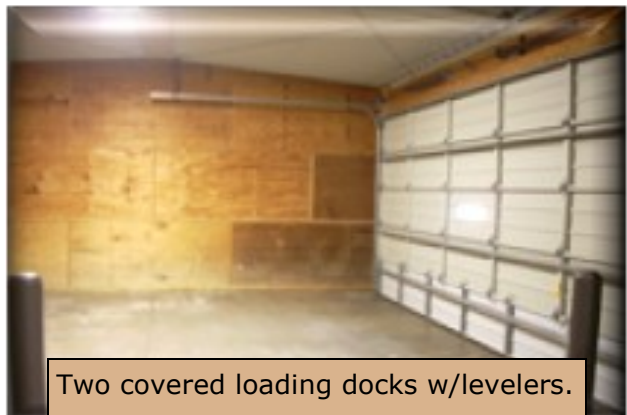
Two covered loading docks w/levelers.