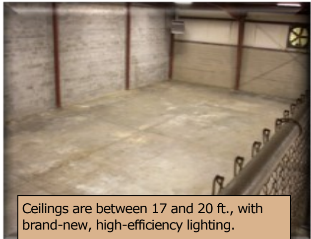
Ceilings are between 17 and 20 ft., with brand-new, high-efficiency lighting.