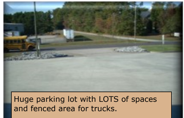
Huge parking lot with LOTS of spaces and fenced area for trucks.

All this, plus a meticulous Landlord to make your business look good! DIRECTIONS: I-985 to exit 22, west 1/2 mile to Airport Rd., right to HFC, left to get to the front entrance.