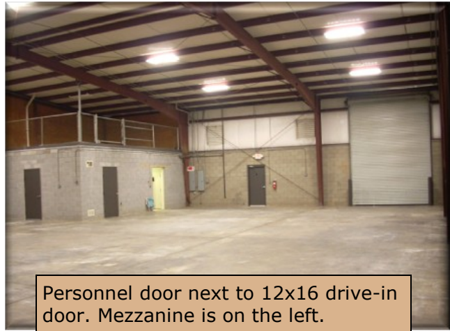
Personnel door next to 12x16 drive-in door. Mezzanine is on the left.