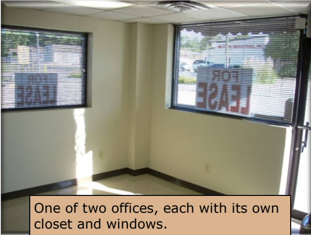
One of two offices, each with its own closet and windows.