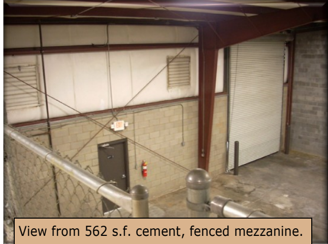
View from 562 s.f. cement, fenced mezzanine.