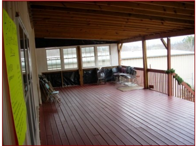
Large front porch to enjoy the weather.