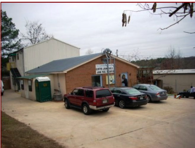
More parking space.