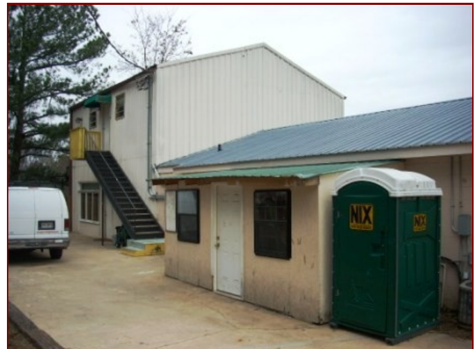
Side of building.