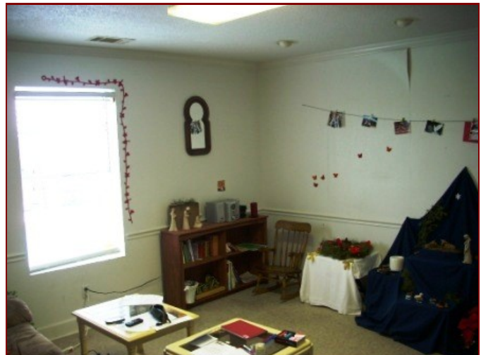
Den of apartment.