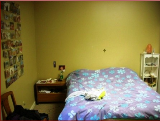
Den apartment bedroom.