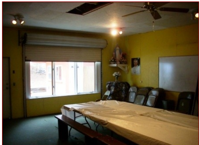
Several offices and meeting areas are in the facility.