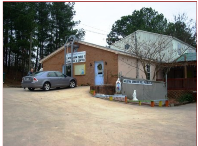
Lots of room to park.