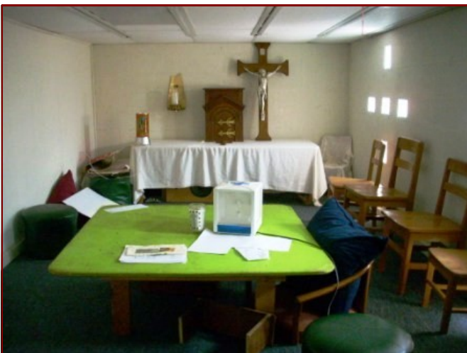
Various office and meeting rooms.