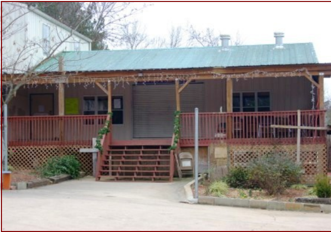
Nice look with big front porch and loading door.