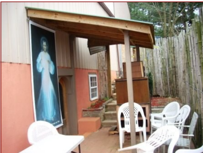
Rear patio area.