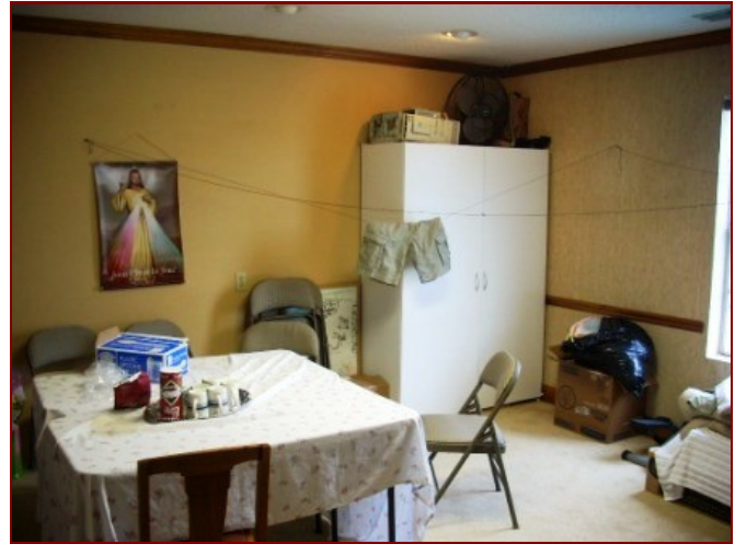
Kitchen in second den.