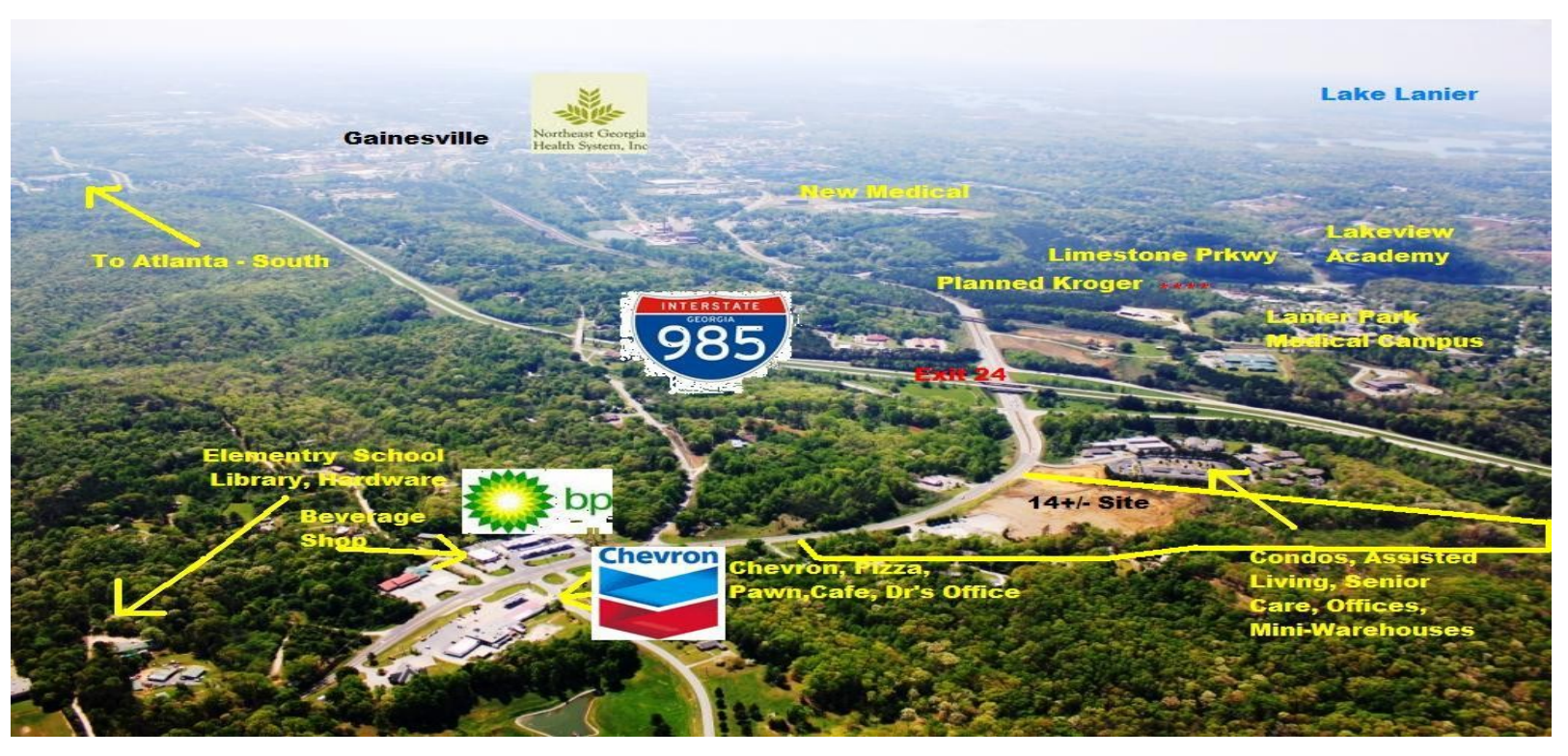
I-985 is THE interstate serving Gainesville/Hall County and points North.