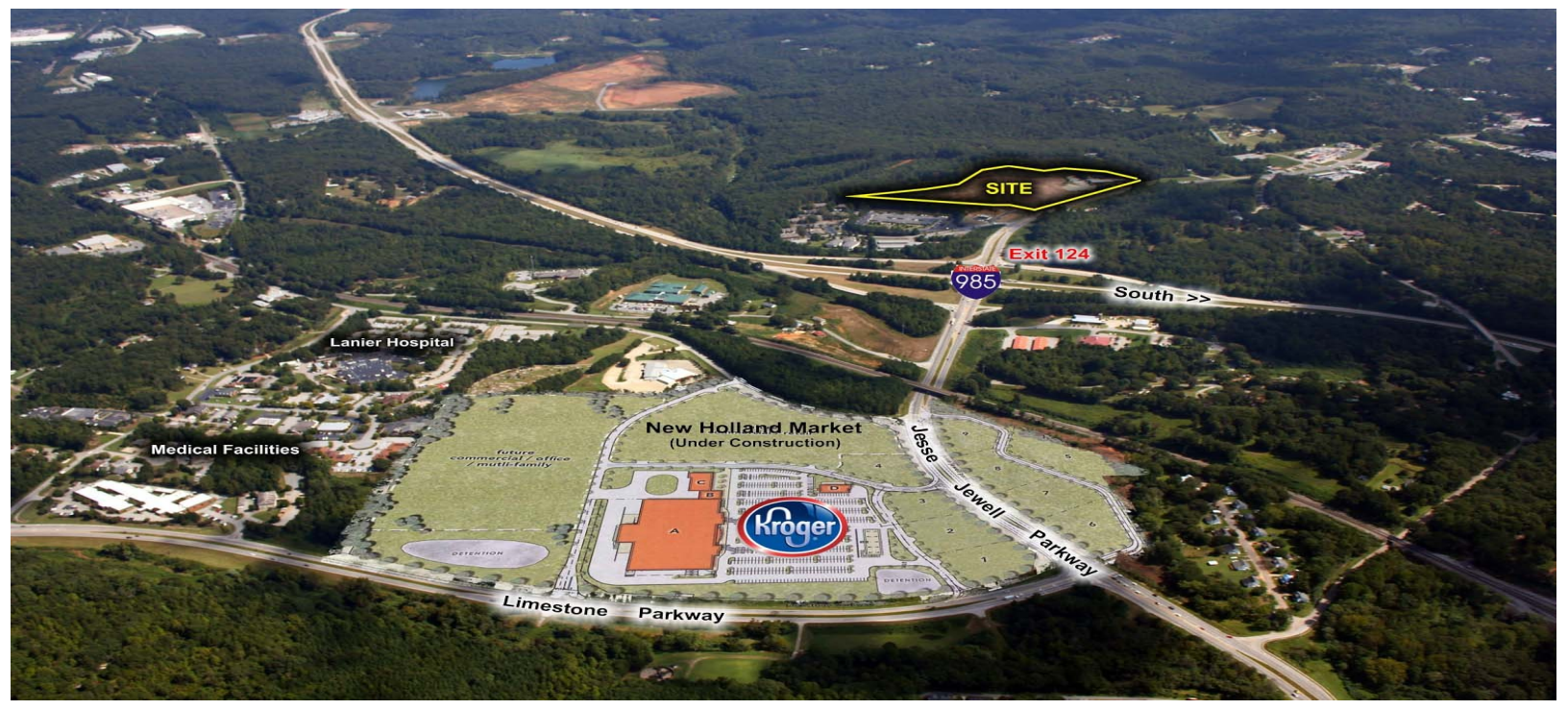
2251 Jesse Jewell Parkway - 30507