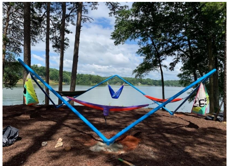
"Hammock Hollow" is an installation for Vision 2030 Public Art, in collaboration with Hall County Parks and Leisure Services. This useable piece of art allows visitors of Laurel Park to relax and swing in their own or the structure's hammocks on the shores of Lake Lanier.