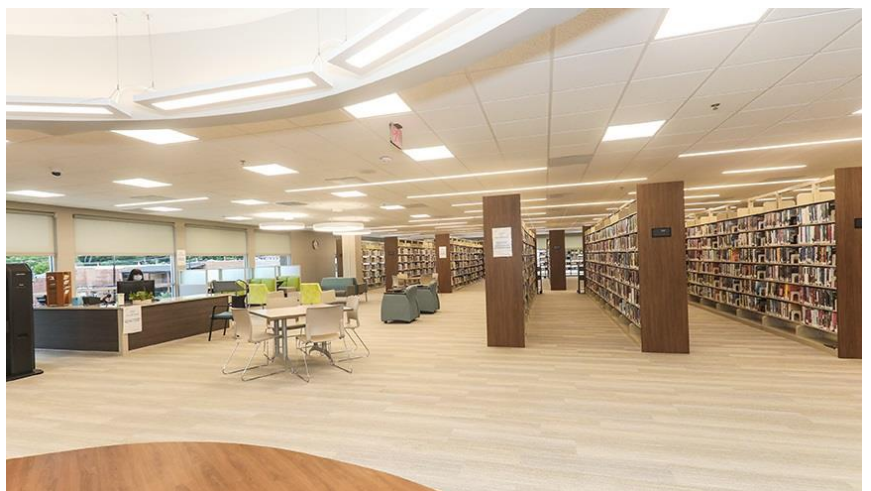
The Hall County Library – Gainesville Branch recently completed $5 million in renovations including study rooms and the new Sandra Dunagan Deal Storytime Room.