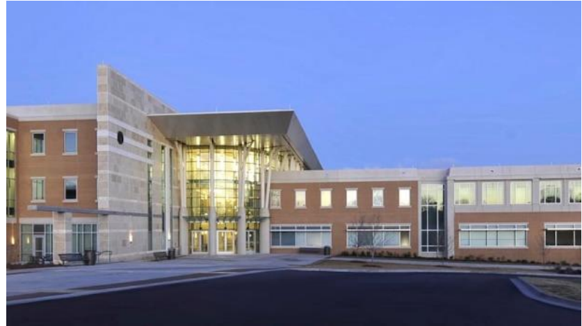
University of North Georgia – Gainesville Campus