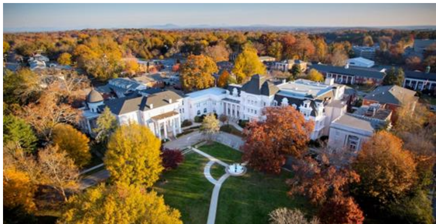
Brenau University – Gainesville Campus