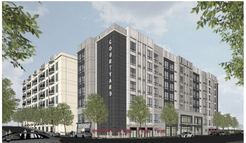
The National, a $72 million redevelopment project featuring a seven-story, 130-room Courtyard by Marriott hotel, convention space, apartments, an outdoor plaza, and dining