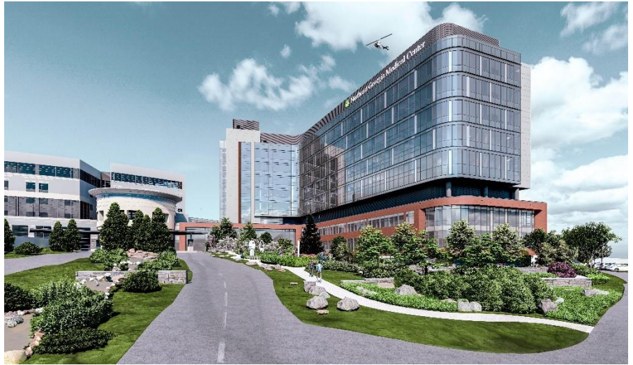
Northeast Georgia Health System announced plans to expand Northeast Georgia Medical Center Gainesville including the addition of a new, multi-story tower, planned to open in early 2025.