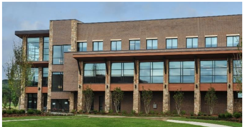
Lanier Technical College – Gainesville Campus