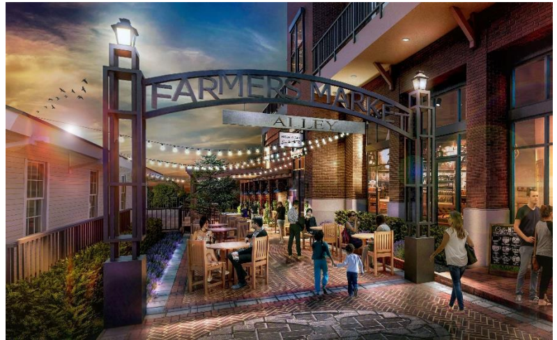
The Farmers Market Pavilion is under construction in Downtown Flowering Branch.