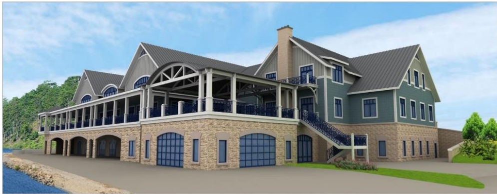
Renovations on the boathouse at the Lake Lanier Olympic Park will be underway by April 2022 with estimated completion in fall 2023. The renovated boathouse will provide over 10,000 square feet of meeting space, including a ballroom and boardroom available for rental.