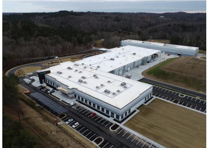
Kubota's new Research and Development Center, scheduled to open Spring of 2022