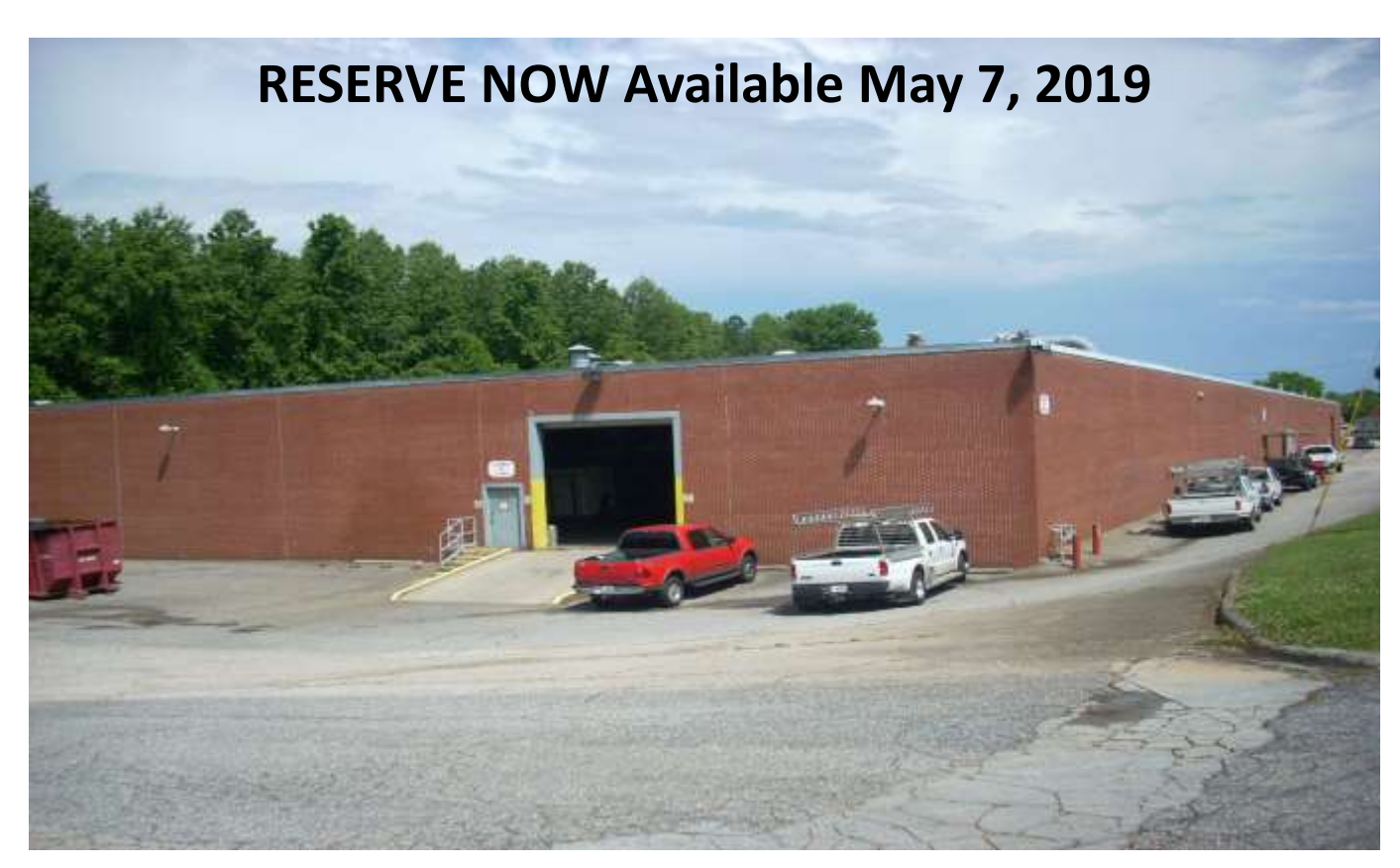
470 Suite E Woods Mill Road, Gainesville 30501

$3.75 p.s.f. $6,156.00 per mo. + $100 mo. for water & sewer