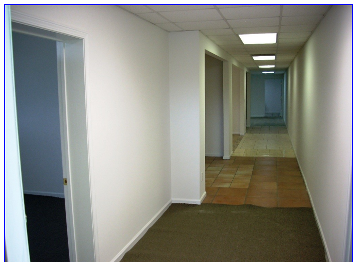
Several offices and large meeting/display Room. New carpet and various tile colors.