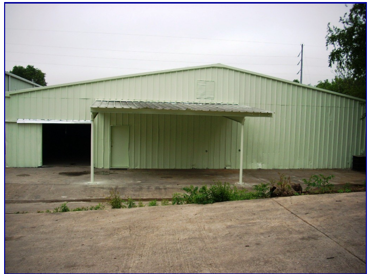
Rear View of Work Area and Covered Parking