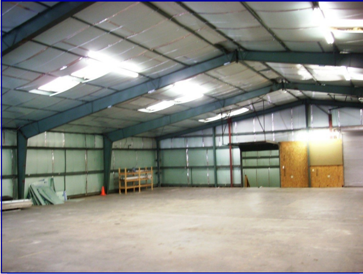
One LARGE Drive-In Door and Loading Dock