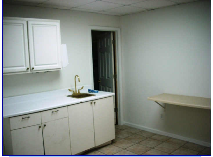
Break Room with Tile Floors