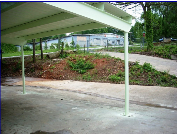
Rear Area Has Its Own Drive, Fenced Storage, and Covered Parking