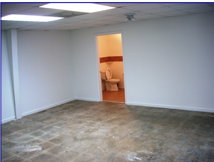
Large display or meeting area. Owner will carpet or tile, per your instructions.

Click here to request e-mail on this property