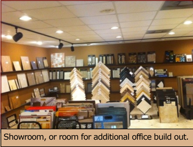
Showroom, or room for additional office build out.