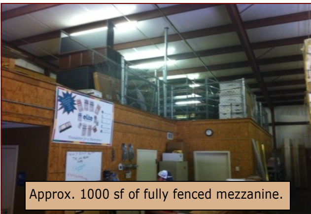
Approx. 1000 sf of fully fenced mezzanine.