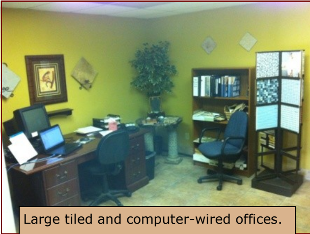
Large tiled and computer-wired offices.