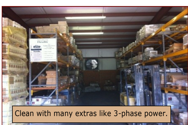
Clean with many extras like 3-phase power.

All this, plus a meticulous Landlord to make your business look good!