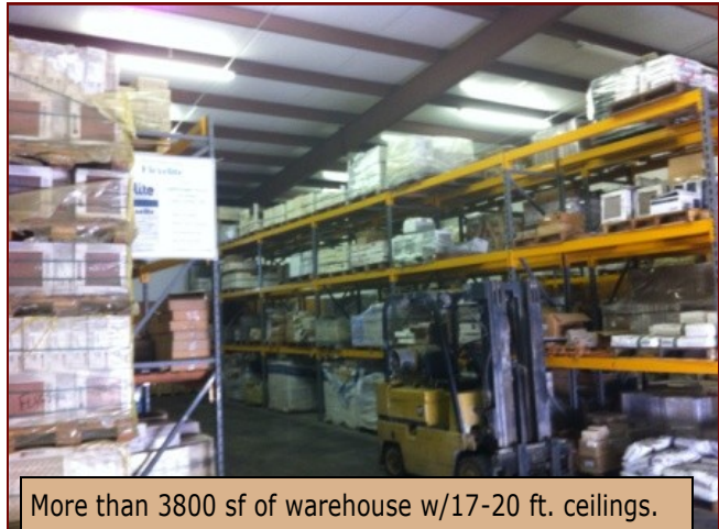
More than 3800 sf of warehouse w/17-20 ft. ceilings.