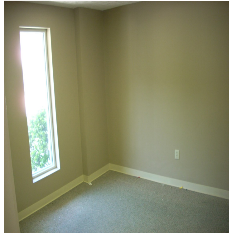
One of two computer wired offices