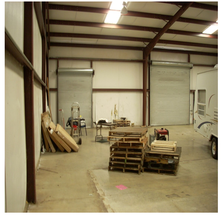
Warehouse has great ventilation and sky lights. Inside water spigots. City Water and Jackson EMC