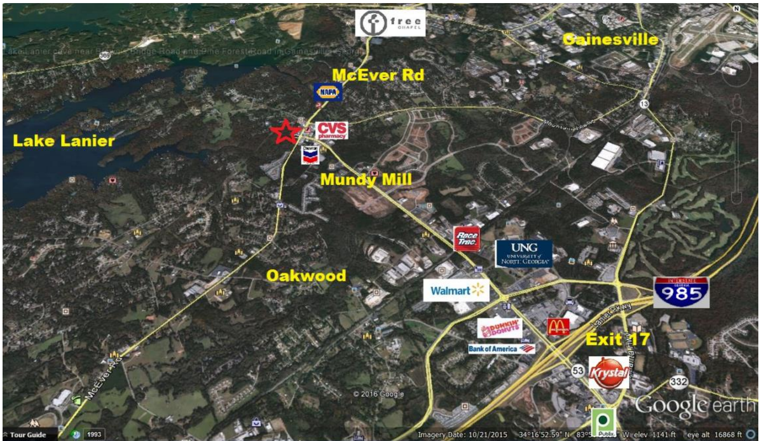
Too many retail centers, offices, and restaurants to list