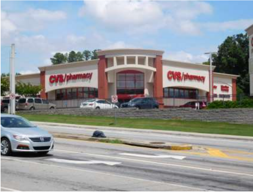
Across from CVS at corner