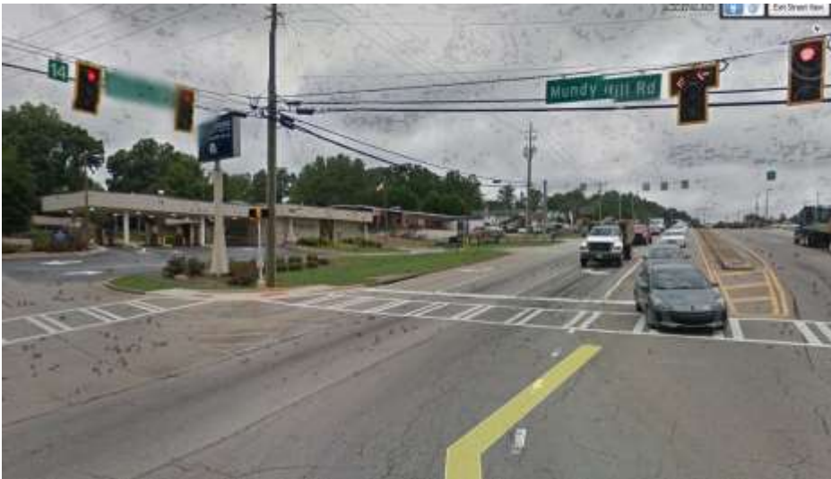
Associated Credit Union across the street