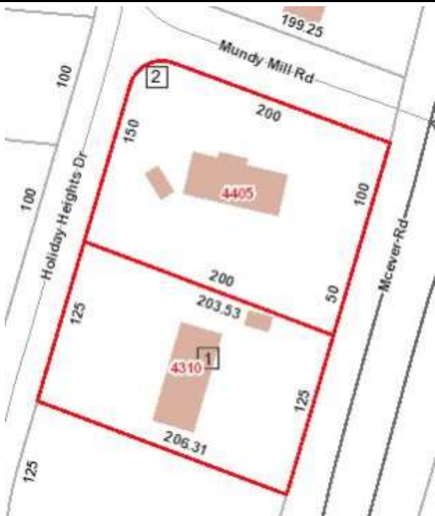
Property dimensions showing structures