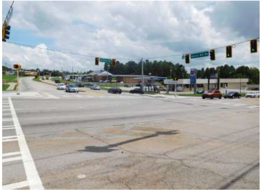
Chevron on opposite corner