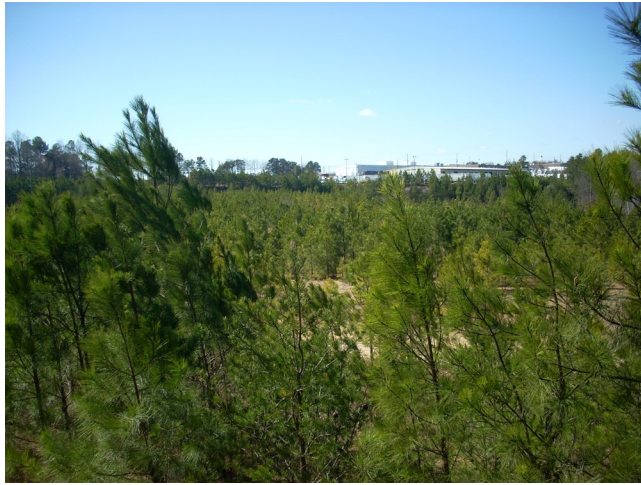
Small pines cover graded front portion of property