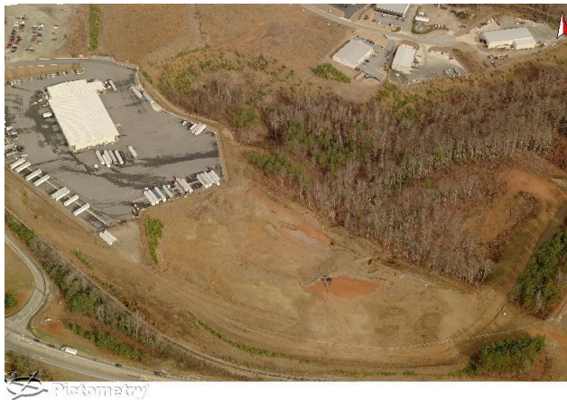
Portion near rail road is graded