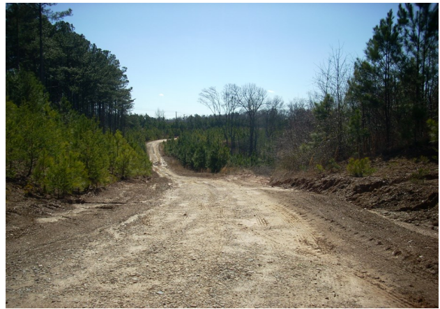
Front access road adjacent to rail in place

More info and video at www.BrentHoffman.com BERKSHIRE HATHAWAY | Georgia Properties 770-533-6721