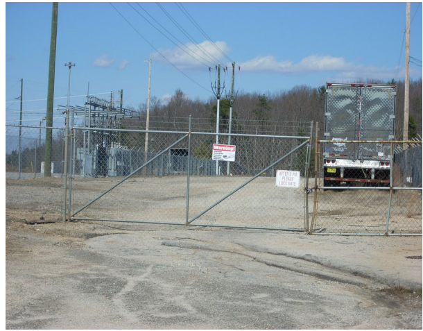
Several road access points