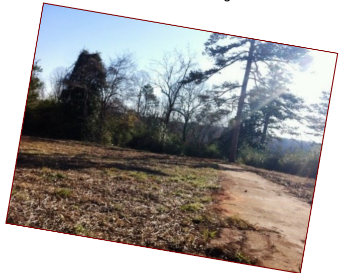
Driveway into Lot with Perfect Slight Drop in the Back for Basement or Parking