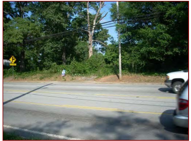
Nice Level Frontage