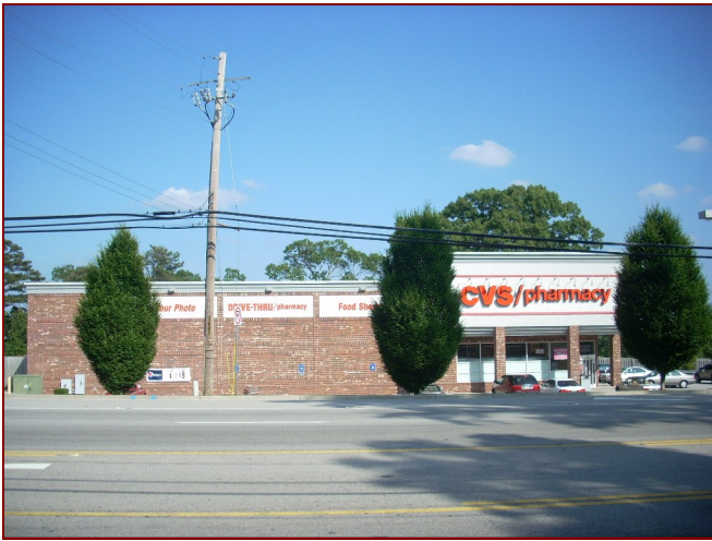
1.29 acre lot next to CVS Drug Store on Cleveland Hwy. (Park Hill Drive) Gainesville