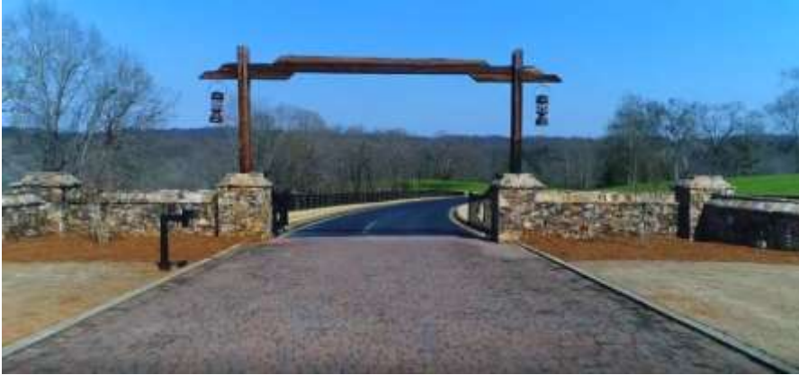
Gated entrance with remote entry