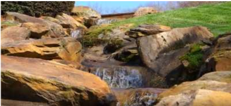
Beautifully landscaped with waterfalls