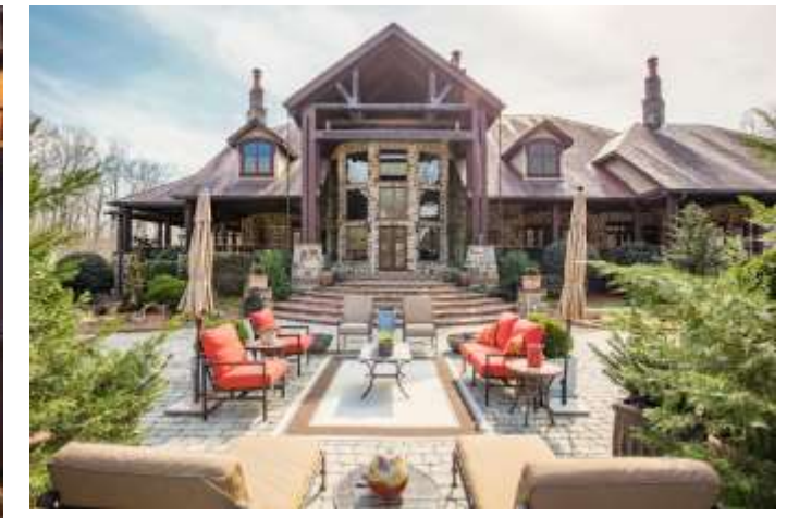
All materials furnished is from sources deemed reliable, but information has not been verified and is subject to errors or omissions