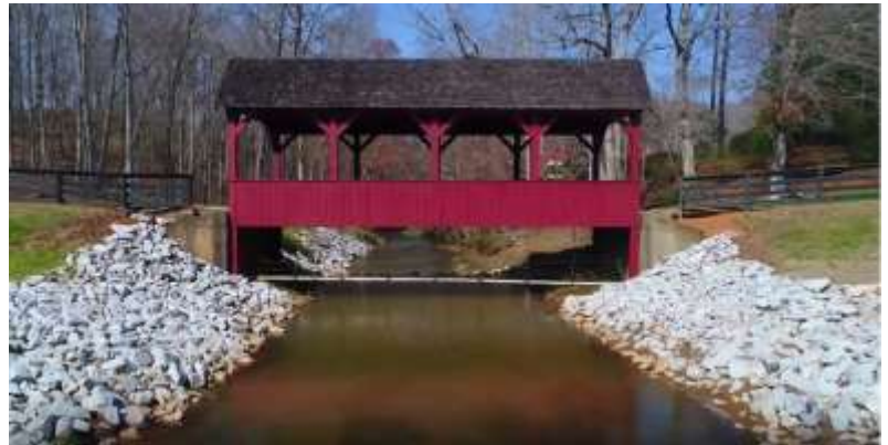
Lovely covered bridge over the Walnut River that flows thru the property and a 6 acre lake for fishing