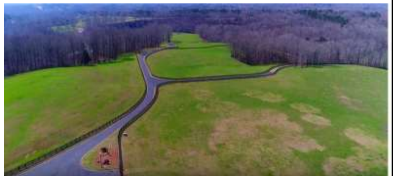
Extensive paved roads with curbs and gutters throughout property