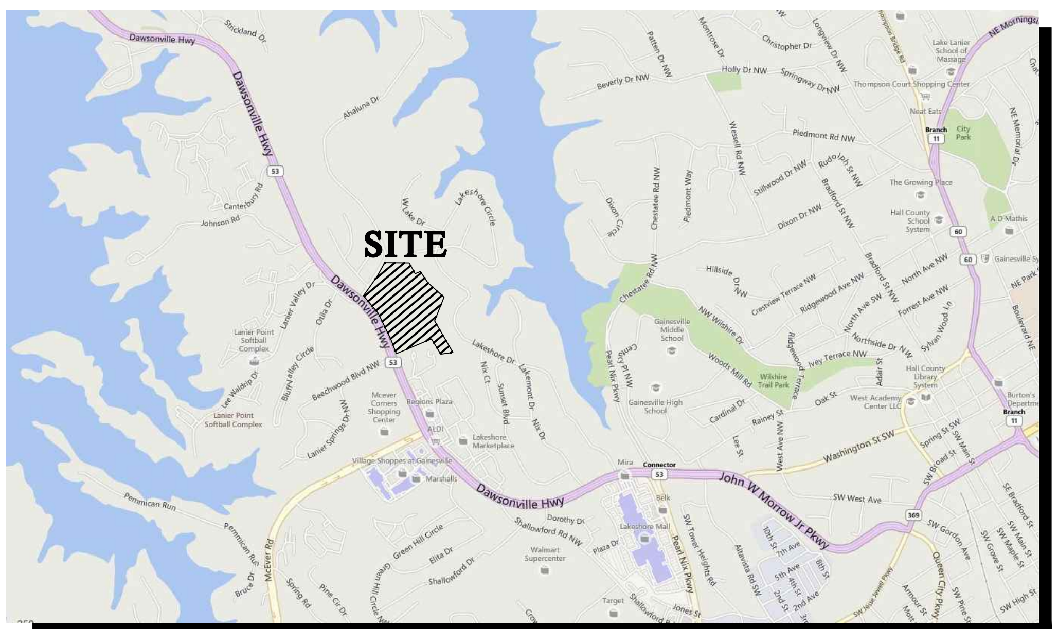
VICINITY MAP SCALE: NONE