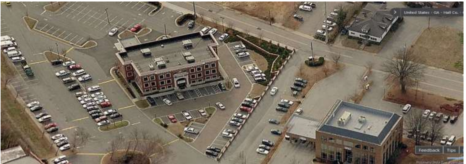
Extensive parking in a park like setting