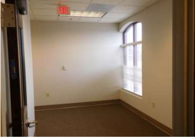
Receptionist area- plenty of window light!