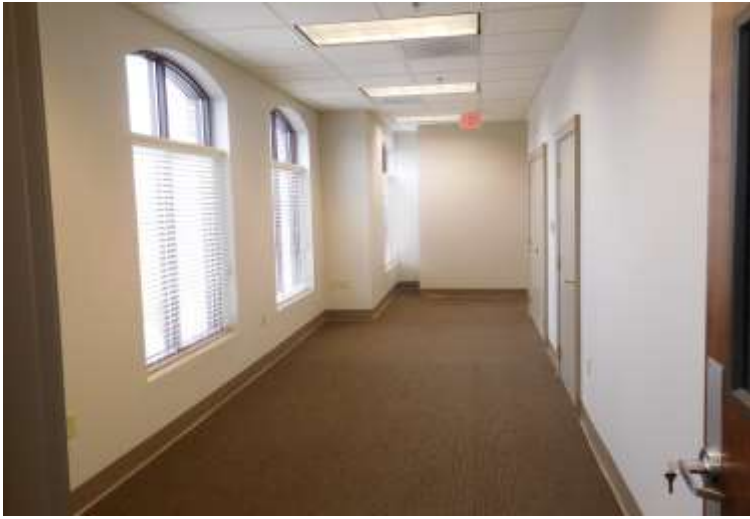
Reception / Entry Hallway

Suite 2- 1,730 s.f. with reception and 3 offices + large reception - one could be XTRA-LARGE training room or bull pen area