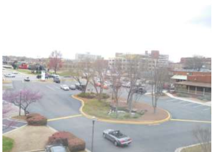
3rd floor view