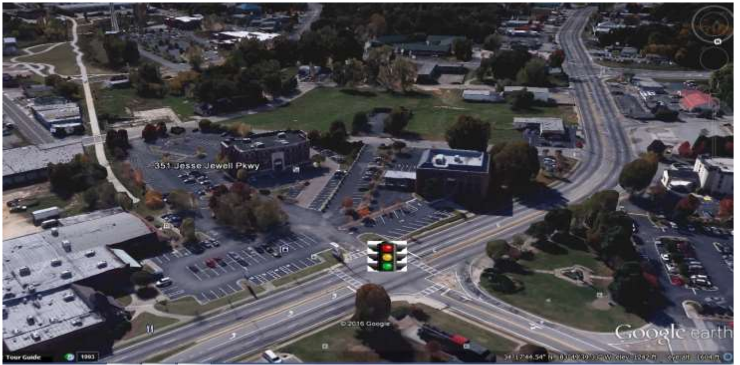
Traffic light access