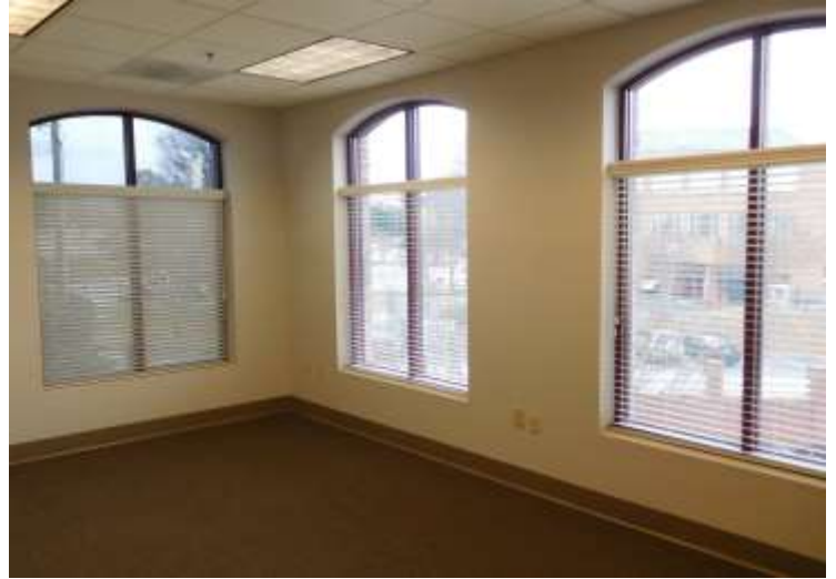
Lg corner office or conference