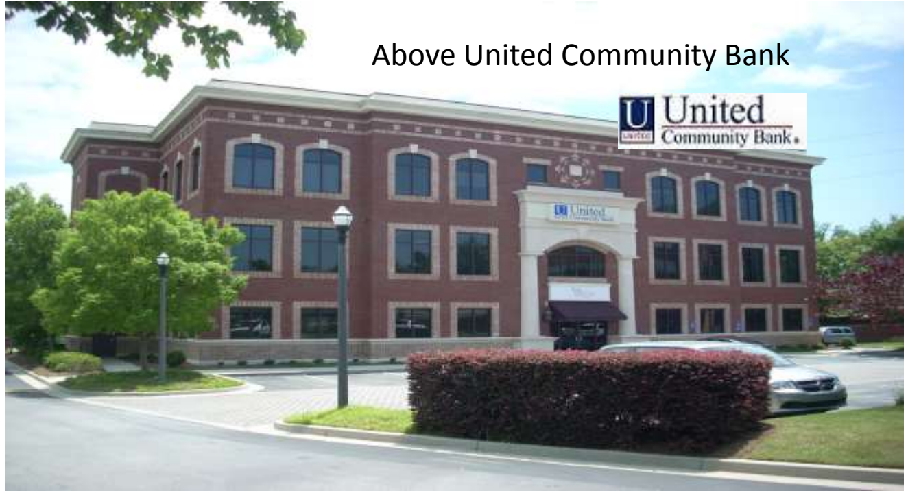
Above United Community Bank

Suite 3 – 1,750 s.f. w/ reception 4 offices & break room