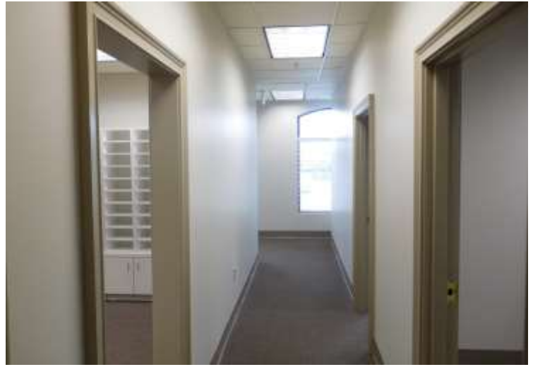
Hallway to 3 offices