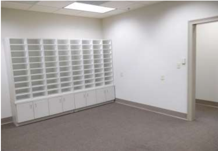
"Training or Bull Pen" area