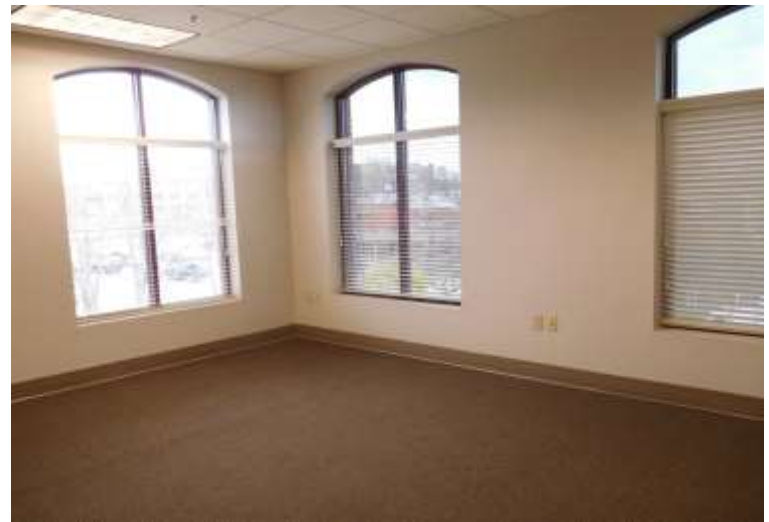
Large corner office