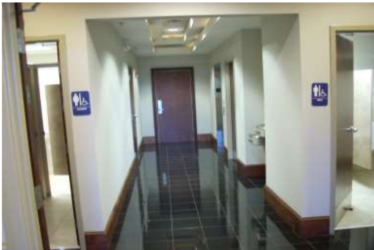
Direct elevator access