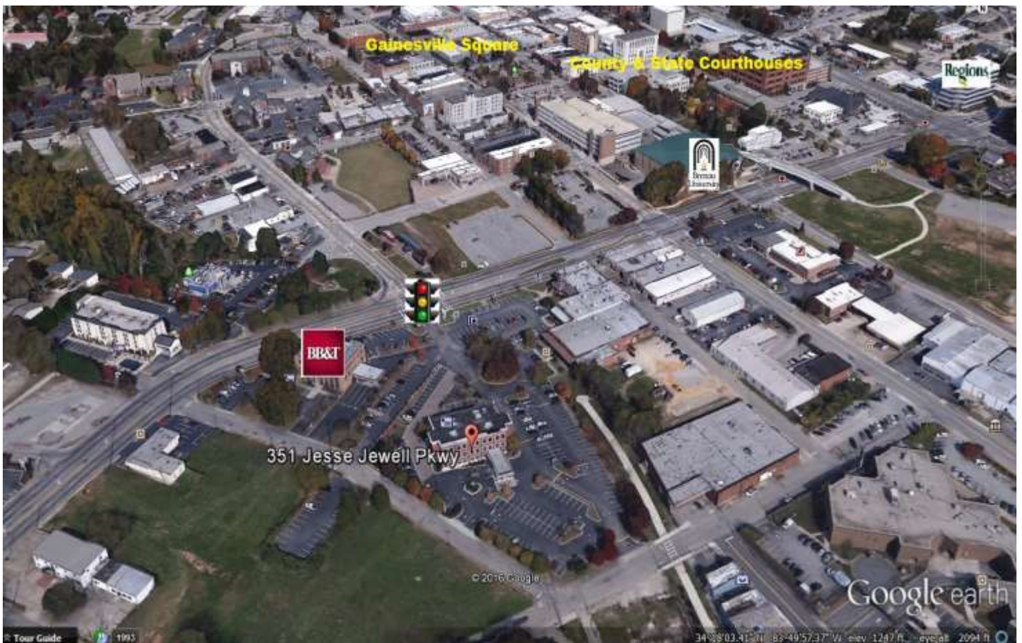
Convenient to downtown and I-985