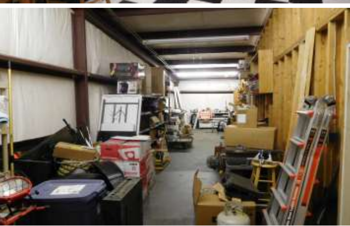
All materials furnished is from sources deemed reliable, but information has not been verified and is subject to errors or omissions