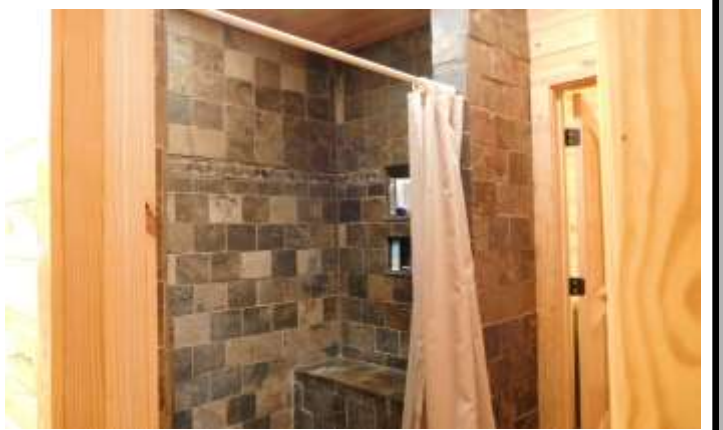
All materials furnished is from sources deemed reliable, but information has not been verified and is subject to errors or omissions